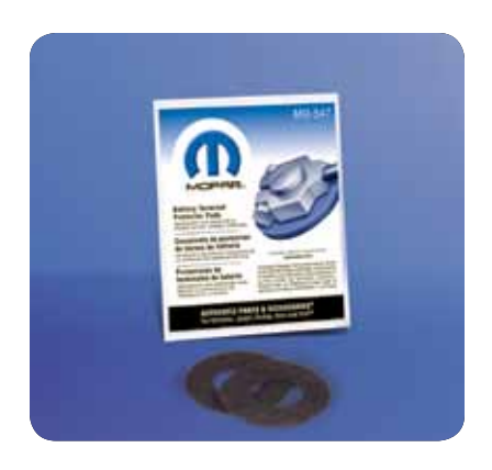
BATTERY TERMINAL PROTECTOR PADS 2 Pads MSQ: 25 Pouches